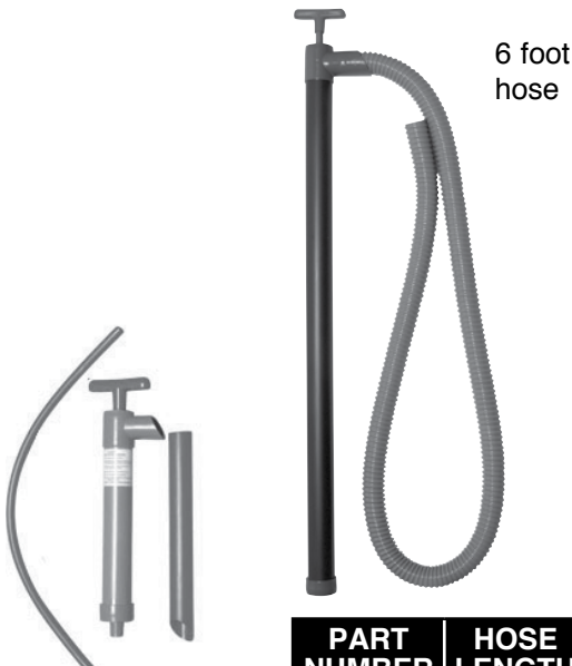
Mini pump ideal for draining traps or curved pipe