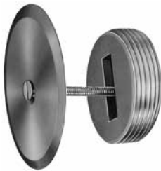
UPC Slotted Countersunk