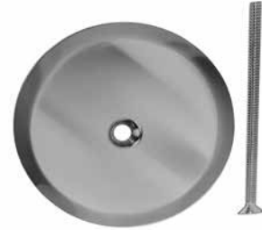
Cover Plate with 1/4" - 20 x 4" bolts