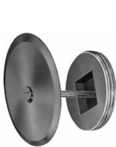
SC Square Countersunk