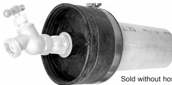
Sold without hose bibb