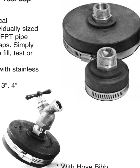
* With Hose Bibb