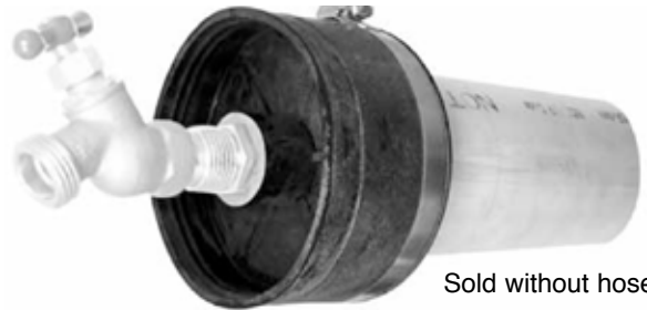
Sold without hose bibb