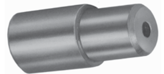
PART NUMBER 4655