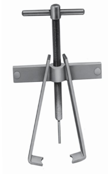
PART NUMBER 4659