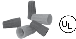
*Screw-On Wire Connectors