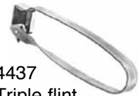
4437 Triple flint