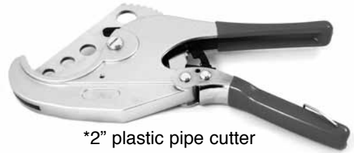
*2” plastic pipe cutter