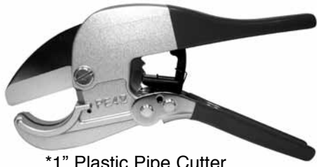
*1” Plastic Pipe Cutter