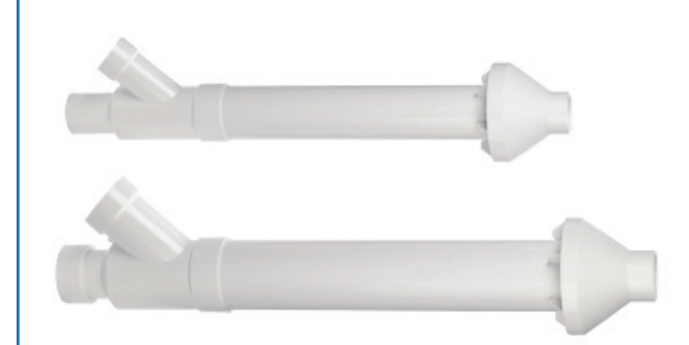
Concentric Vent Kit Dimensions